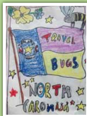
Veera Thorat III - Radium

“A journey is best measured in friends, rather than miles.”