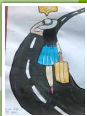
Twinkle Singh VII - Kalam