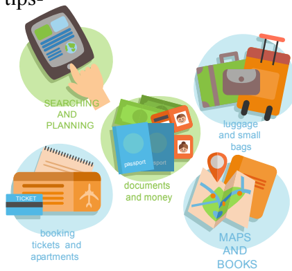
Sakina Danawala VIII Pearl

“The world is a book and those who do not travel read only one page.”