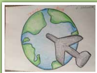
Devshree Wadekar V-Shivalik