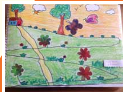
Ved Patel (II-Apple)