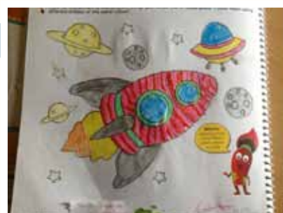
Tanvi Naphade (I-Marigold)