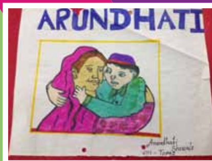
Arundhati Shewale (VIII-Topaz)