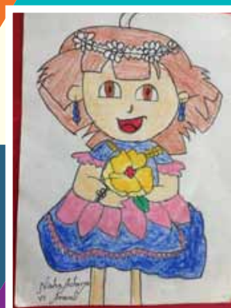
Nisha Acharya (VI-Aravali)

“To handle yourself, use your head; to handle others, use your heart.”