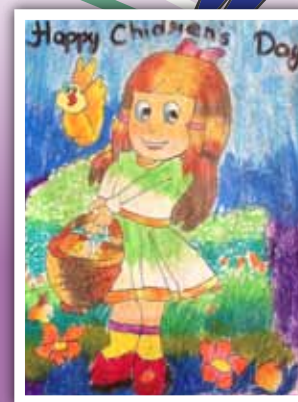
Vardayini Achrekar IV - Vayu