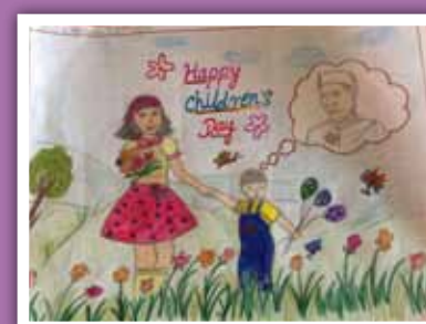
Tanvi Shelke IV - Jal

“There are somethings , which we can't buy , one of such things is our childhood .”