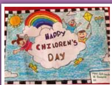
Mitali Sancheti III - Diamond