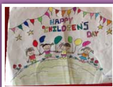
Shreyas Mulay VIII - Topaz