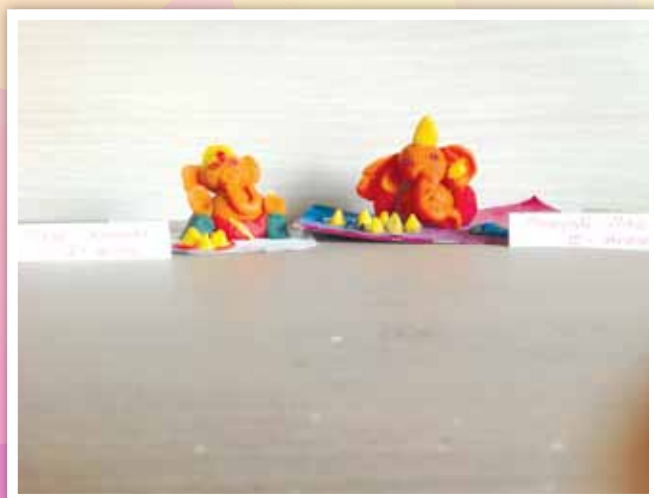
Meet Karde _Pranjali Sao II-Apple