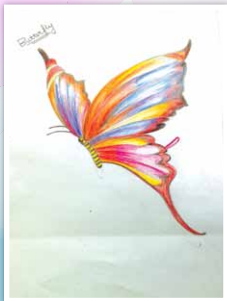
Diya Lodaya VI-Vindhyachal