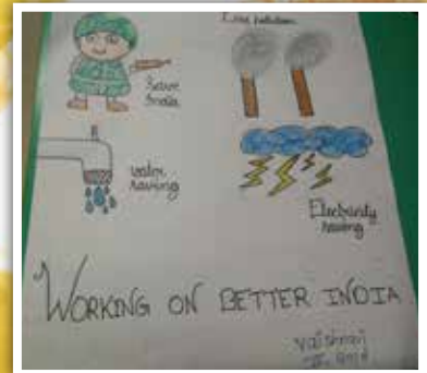
Vaishnavi III Gold