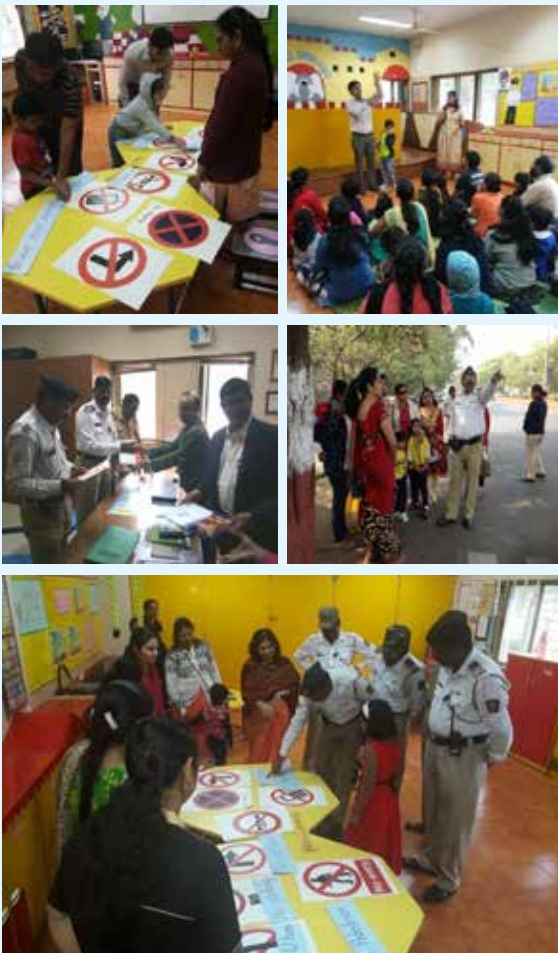
Children learned how to follow the traffic rules.