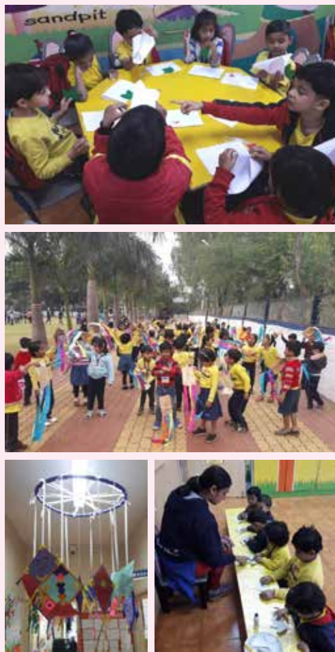
Makarsankranti was great fun as children enjoyed kite flying and made creative kites.