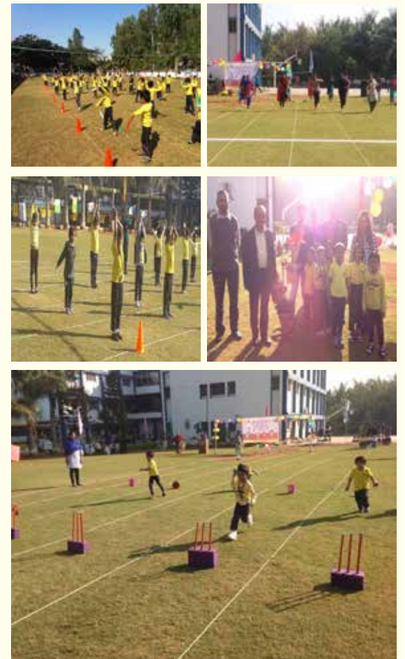
Children enjoyed sports activities and experienced 'Run in the Sun' is so much fun.

"If there is one place on the face of earth where all the dreams of living men have found a home from the very earliest days when man began the dream of existence, it is India!" - Romaine Rolland