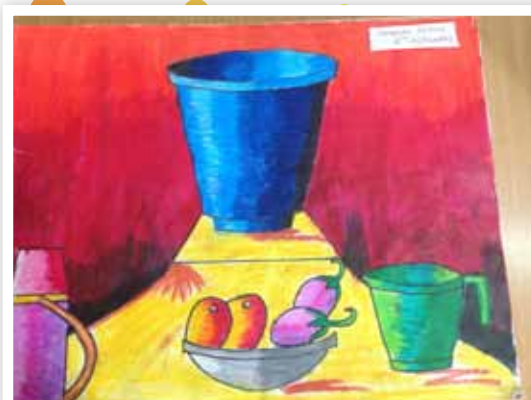
Sampada Dudule (VI-Shivalik)