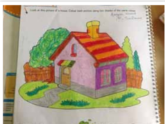
Aryan Khond (I - Sunflower)