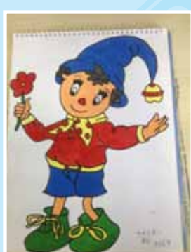
KUSH SHARMA 7 C