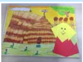
NEHA CHAUDHARI 3A