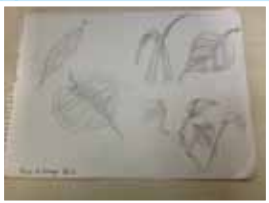
ARYA DHAGE 6C