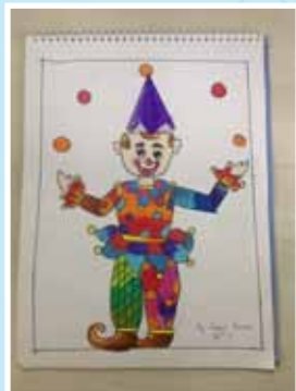
GAURI DEORE 4C