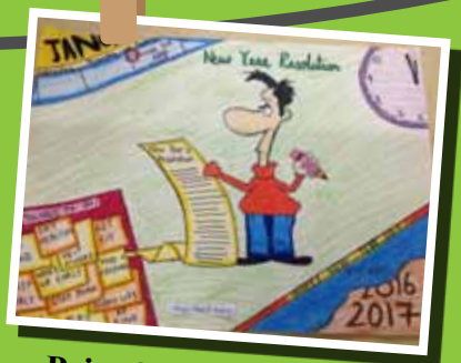
Priya Patil (VII kalam)