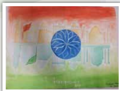
Himanshi Pandey 8 Pearl