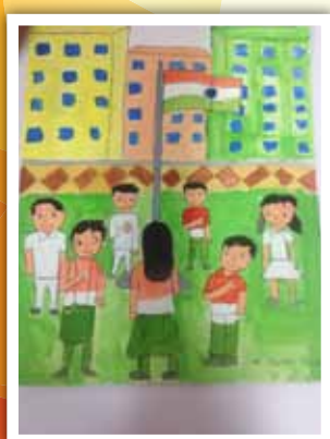
Pankaj Pandit 5 Shivalik