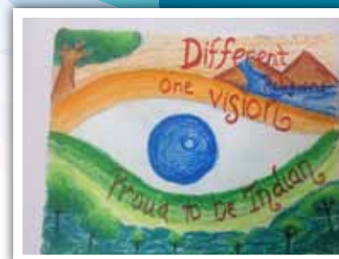
Meet Karamchandani 7 Kalam