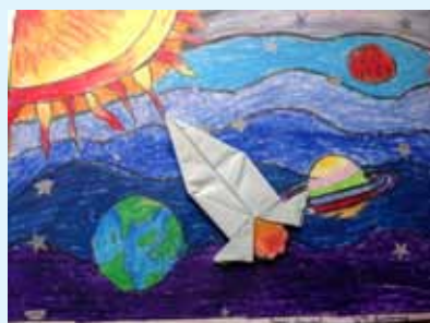
Prachi Sawant (5-Brahmos)