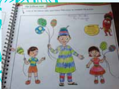
Aarya Shinde (2-Mango)