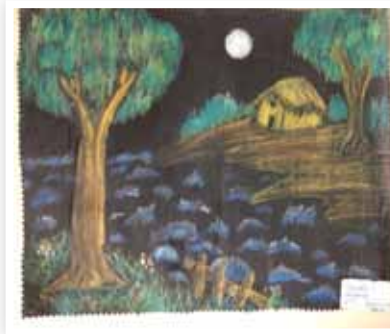
Srushti Bhalerao 6 C