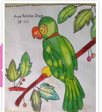
Arya Dhage VI C