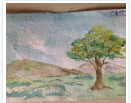
Yash Sutar VI C