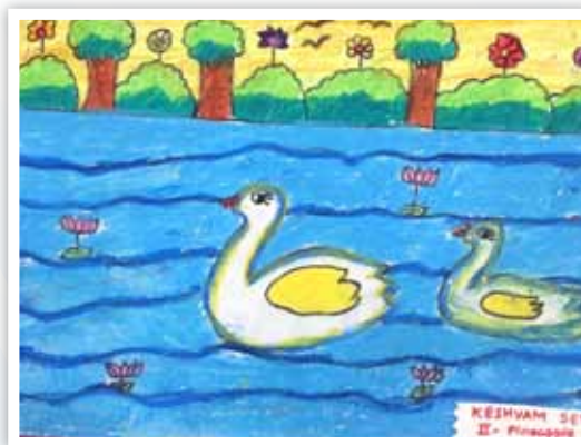
Keshvam Seth (II-Pineapple)