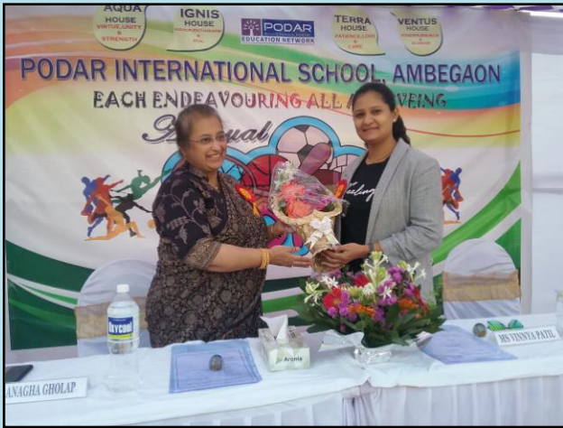
Felicitation of Chief Guest