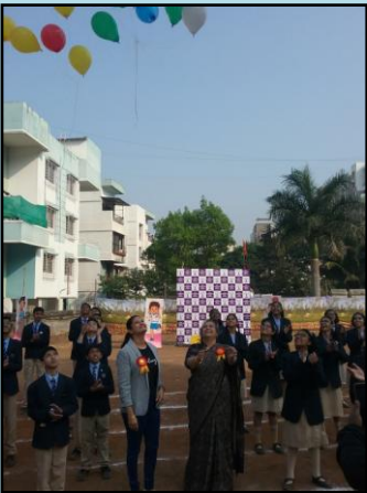
Sports meet open